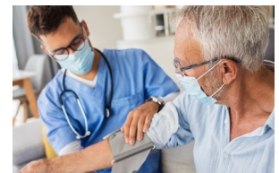
Charge Nurse/ Specialty Nurse