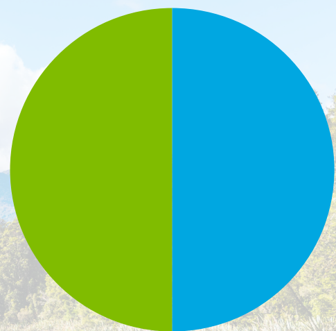
HOSPITAL TYPES IN ATTENDANCE