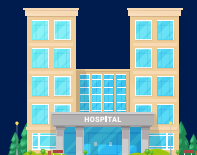
Disproportionate Hospitals (hospitals serving a high percentage of Medicaid patients)