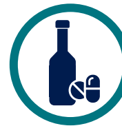
Substance Use Disorder Treatment