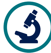
Cancer Screening and Prevention