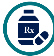
Communicable Disease Programs