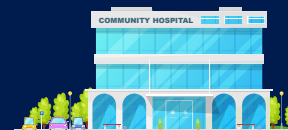
Sole Community Hospitals